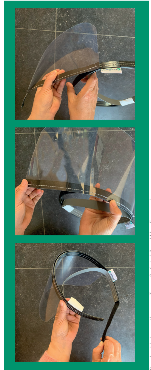
Product information conTeyor Safety Visor NA - Eng - v1

Do not expose to high temperature. Do not apply high pressure.